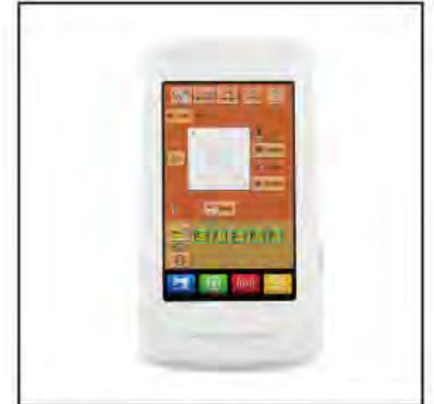
觸控屏 Touch Screen